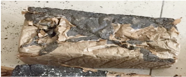
Fig. 3. SP brick with 25% by weight of PW